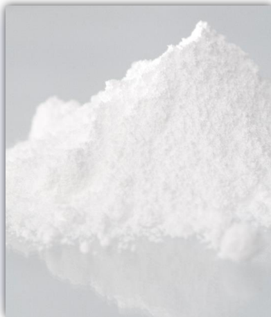
Typical Loading Levels for Bismuth Subcarbonate in Medical Polymers

Manufactured under ISO 9001 registered quality management systems.